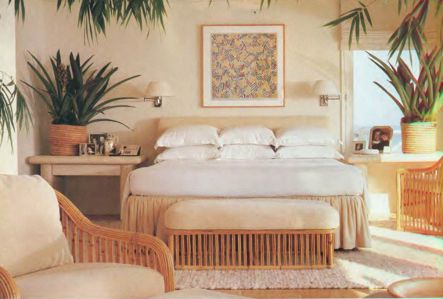
Geffen, who has also collected Tiffany and Gallé lamps, has been acquiring art since the early 1970s. ABOVE A 1976 lithograph by Jasper Johns hangs in the bedroom. BELOW: Guests often gather for meals in the outdoor dining area. Umbrella by Santa Barbara Designs. Brown Jordan chairs.